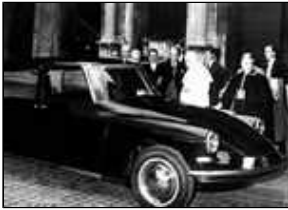
La DS présentée à Papa Giovanni XXIII.