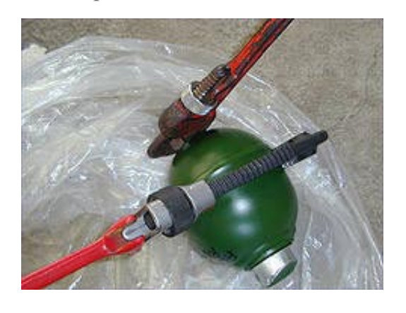
How to operate

At first, screw off the nipple of the sphere, using 2 water pipe wrench.